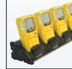
Multi-unit cradle charger